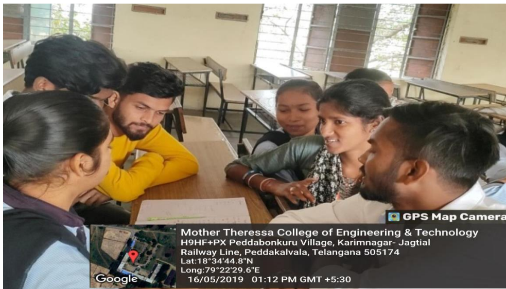
THINKS PAIR-SHARE: III YEAR ECE STUDENTS