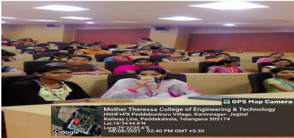
TWO DAY WORKSHOP ON "ENTREPRENEURSHIP DEVELOPMENT"