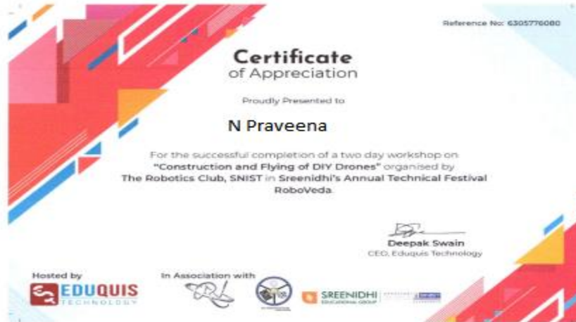
CERTIFICATE OF APPRECIATION OF PARTICIPATION IN TECHNICAL FAST AT SNIST