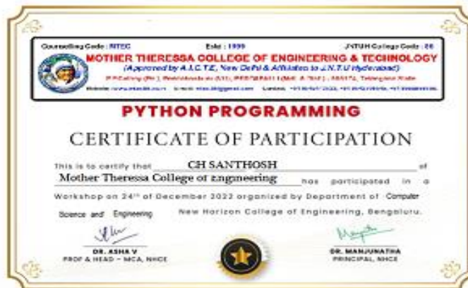
CERTIFICATION OF PARTICIPATION IN WORKSHOP IN AT MTEC