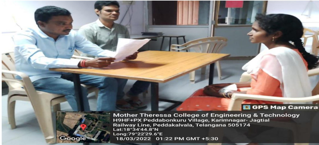
Mock Interview: IV Year CSE Student