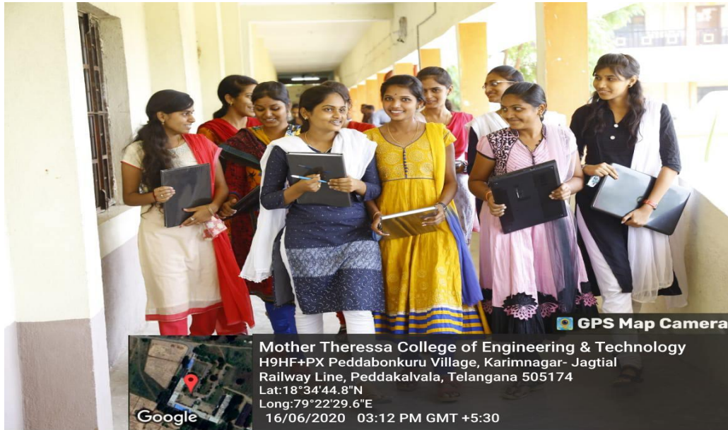
THINKS PAIR-SHARE: IV YEAR EEE STUDENTS

Thinks Pair – Share: Implemented in classrooms to help students to form individual's ideas, discussions and share with in others groups.