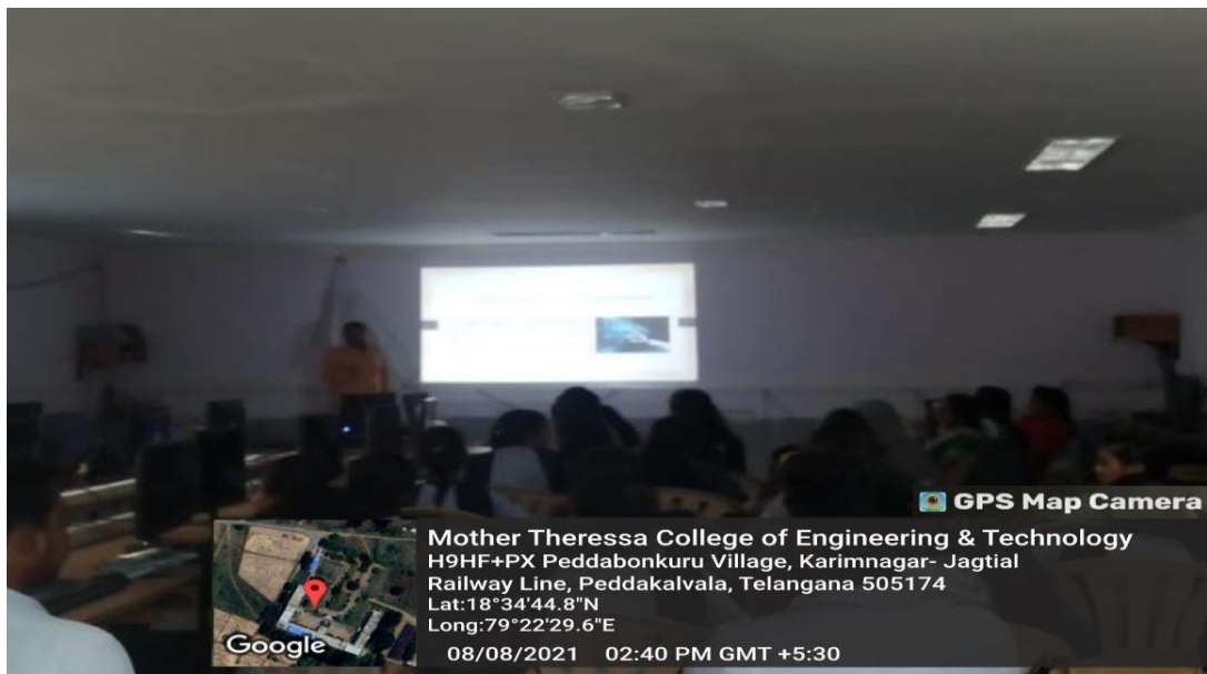
ONE DAY WORKSHOP ON "ANALOG APPLICATIONS ENGINEER"