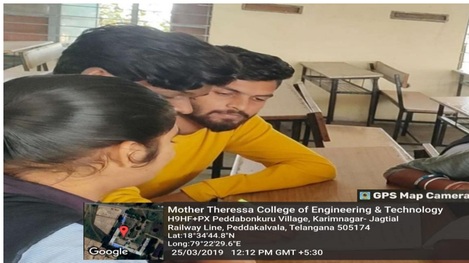
THINKS PAIR-SHARE: II YEAR CSIT STUDENTS