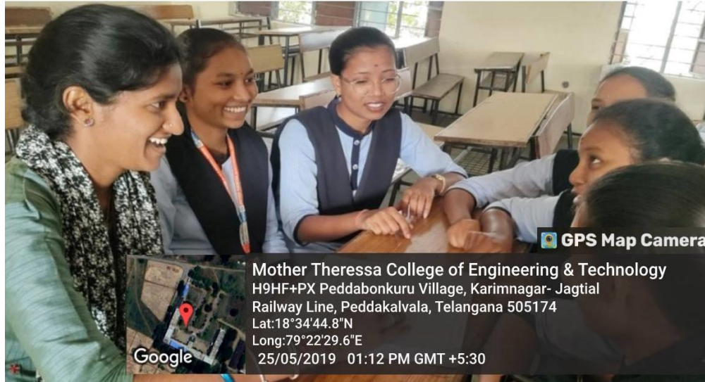
THINKS PAIR-SHARE: II YEAR ECE STUDENTS