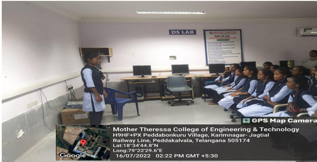
Technical Presentation B.TECH CSE final Year Students

Technical Presentation: The students are reinvigorated to take part in technical Events to show case their performance skill through poster, paper and model presentations.