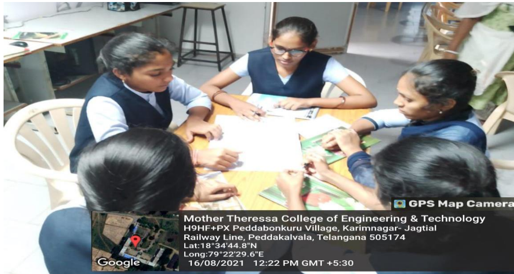
Small Group Based Assignment B.TECH Student

Group Assignments/Mock Interviews: Group discussions are piloted from Second Year onwards for soft skills developments. Mock interviews are conducted before the campus Placements, to expend self –confined levels in the student.