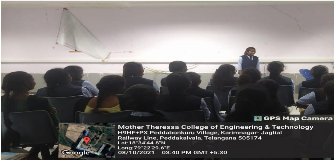
Technical Presentation B.TECH EEE final Year Students