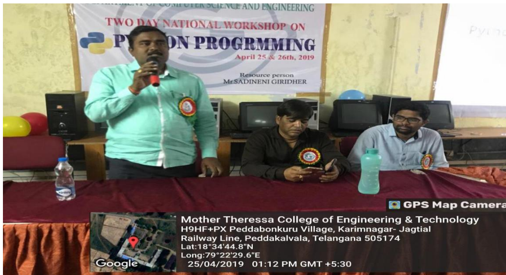
WORKSHOP:" PYTHON PROGRAMMING" FOR CSE STUDENTS