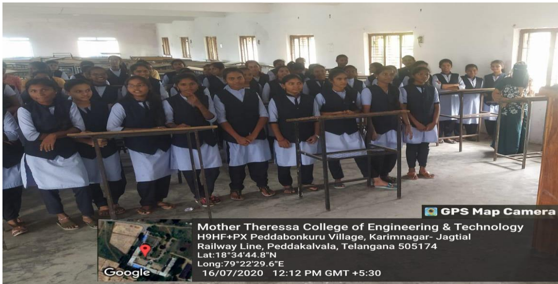
Technical Presentation B.TECH CSIT Second Year Students