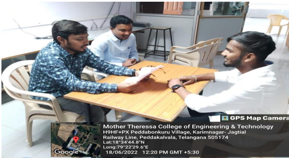
Mock Interview: IV Year ECE Student